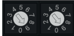
Example: Rotary Switch showing ID No. 99.

You can choose any numbers you wish up to 99 but no 2 units within radio range can have the same number