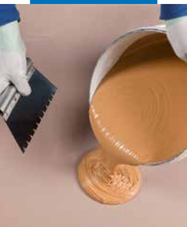
Excellent keeping and stability of the product