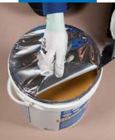
Easy and fast removal of the sealing film