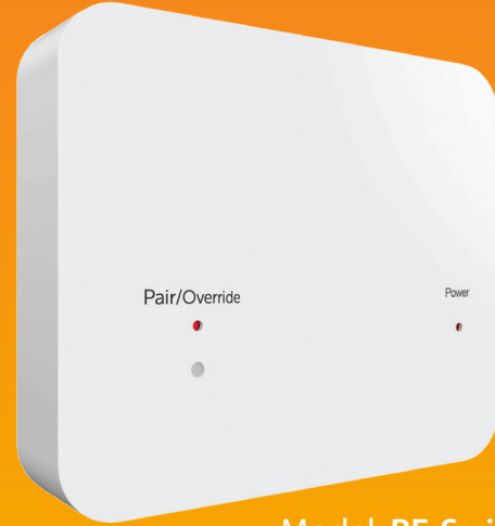
Model: RF-Switch 16A